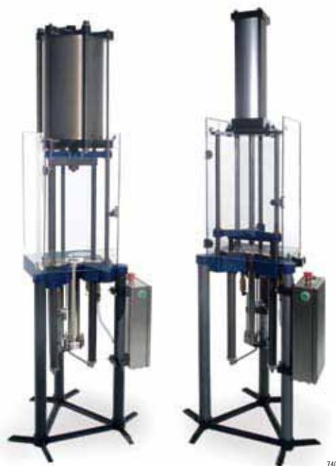
25 and 50mm i.d. Multipacker® Instruments.

Unlike column-packing systems that use awkward hand pumps and can require hours for column packing, Spring™ Column packing takes only minutes and operates with the push of a button. Multipacker® instruments use modular construction that makes them lightweight and easily assembled or disassembled. Key components are produced using advanced aluminum casting techniques that reduce manufacturing costs and provide high strength and reliability.