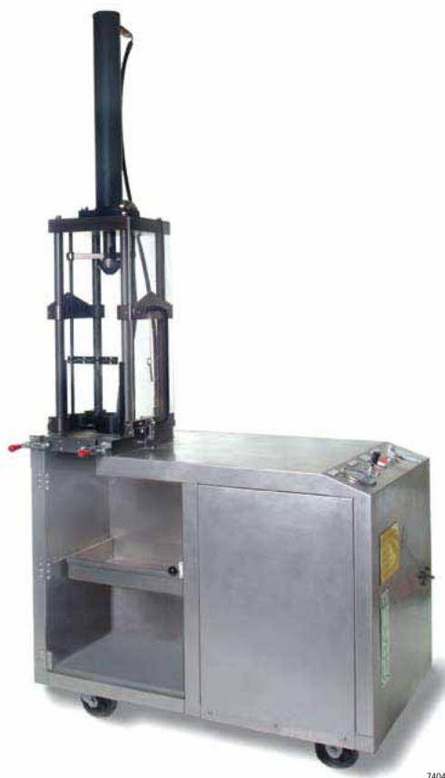
101mm Multipacker® Instrument.

Multipacker® instruments require Spring™ Column hardware, purchased separately, for column packing. See listing on pages 162–169.